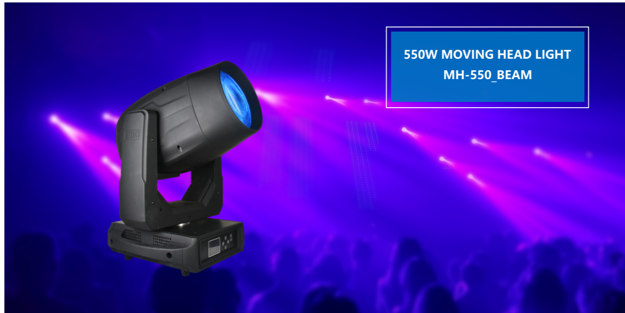
550W MOVING HEAD LIGHT MH-550_BEAM